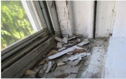
Lead paint chips in window well.